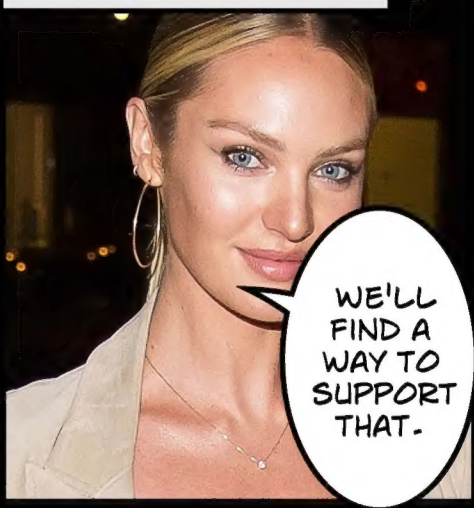
MEANWHILE AT VICTORIA SECRET'S HQ

AND AS AN EXPERT I TRULY BELIEVE IN APPLYING FOR THE REWARDS FOR JUSTICE PROGRAM.